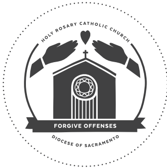
Holy Rosary Catholic Church Yolo Deanery 301 Walnut St, Woodland holyroary.com