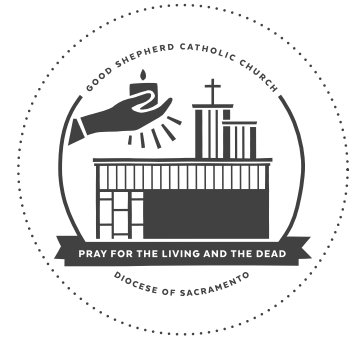
Good Shepherd Catholic Church Southern Suburbs Deanery 9539 Racquet Ct, Elk Grove gscccg.org