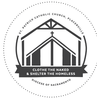
St. Patrick Catholic Church Gold Country Deanery 3109 Sacramento St, Placerville stpatpv.org