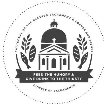
Cathedral Of The Blessed Sacrament City Deanery 1017 11th St, Sacramento cathedralsacramento.org