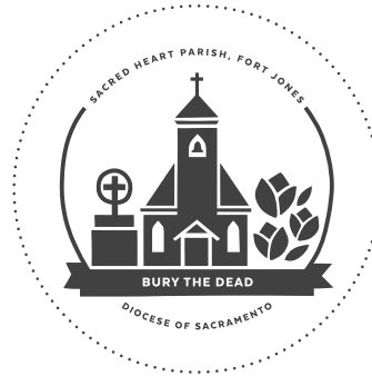
Sacred Heart Parish Siskyou Deanery 101 Carlock St, Fort Jones