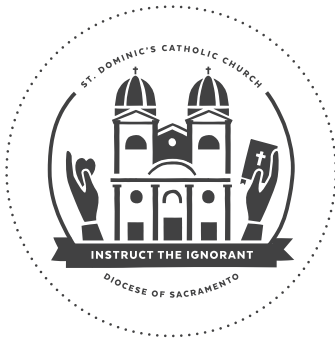
St. Dominic's Catholic Church Solano Deanery 475 E I St, Benicia saintdominicsbenicia.org