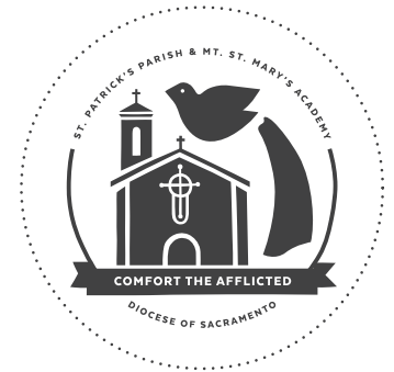
St. Patrick's Parish & Mt. St. Mary Academy Mother Lode Deanery 235 Chapel St, Grass Valley saintpatrickgrassvalley.dreamhosters.com

You can also order a lanyard and set of beautiful collectable pins of the pilgrimage sites from the Diocesan website scd.org .