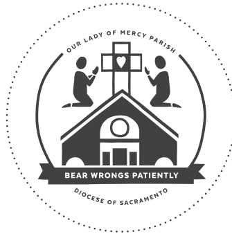
Our Lady Of Mercy Shasta Deanery 2600 Shasta View Dr, Redding olmredding.net